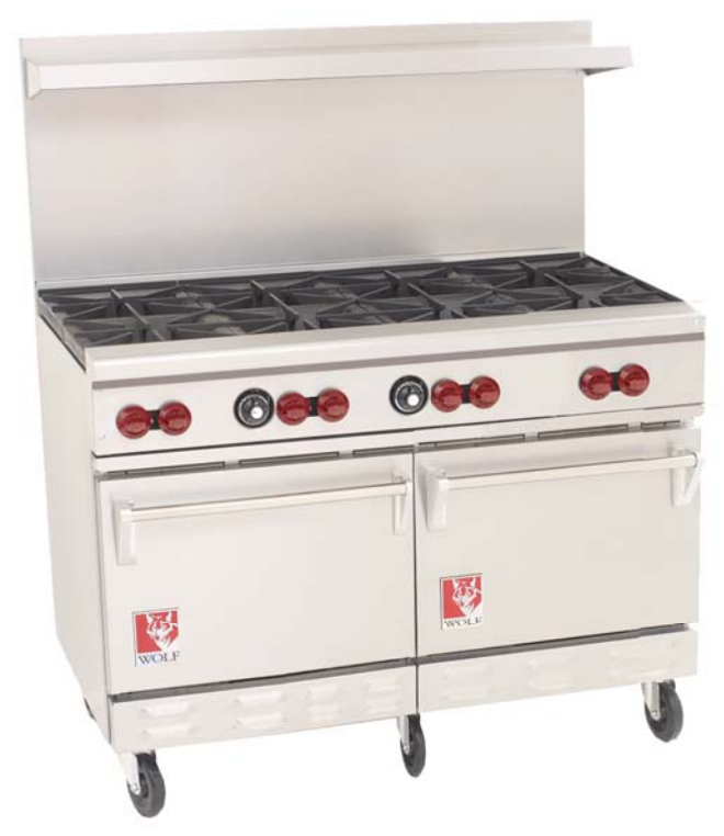
Model C48SS-8 shown with optional casters